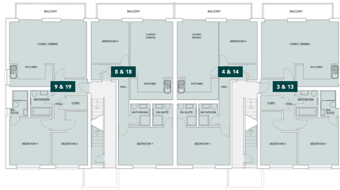
67 m 2 / 720 ft 2 Apartment 9 & 19