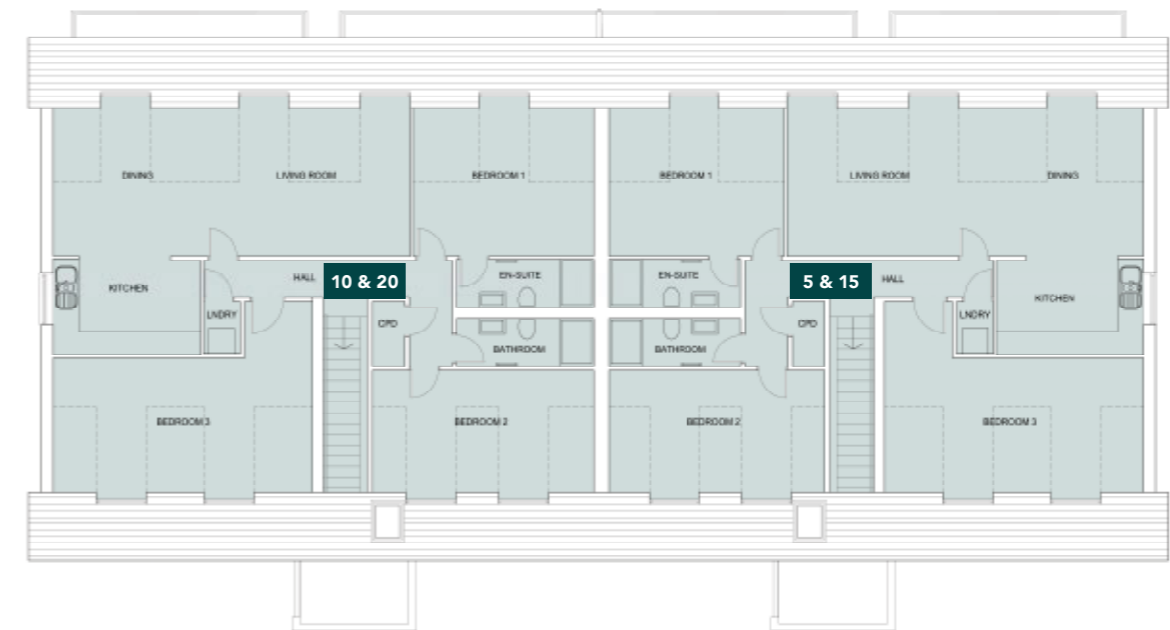
116 m 2 / 1246 ft 2 Apartment 10 & 20