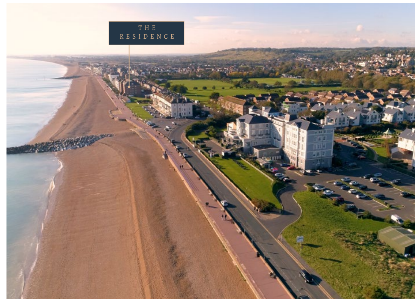
The Hythe Imperial Hotel

Although it is hard to tire of Hythe, there is much to see in the close vicinity. Take a nostalgic trip on the Romney, Hythe & Dymchurch Railway, spot wildlife at Samphire Hoe nature reserve or wonder at the 100 square miles of Romney Marsh wetlands. Also close by are Port Lympne Safari Park and Brockhill Country Park.